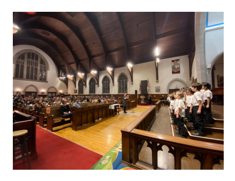
March 9-17 | Mzanzi Conductors Convention in Cape Town, South Africa