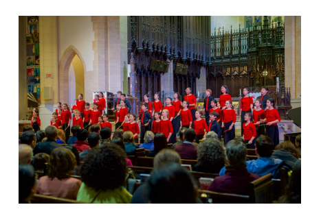
March 1 | Ontario Youth Treble Festival